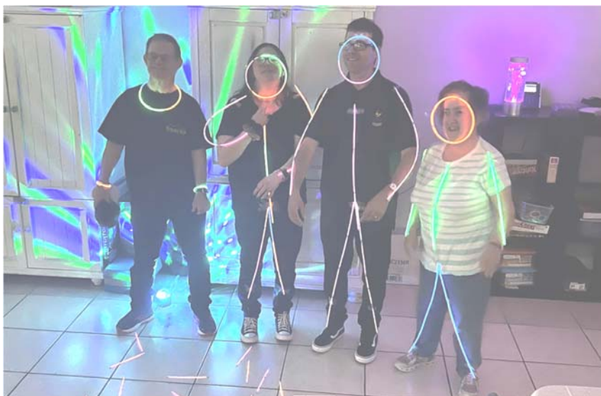
Enjoying some glow stick fun at the 7/25 Neon Night!